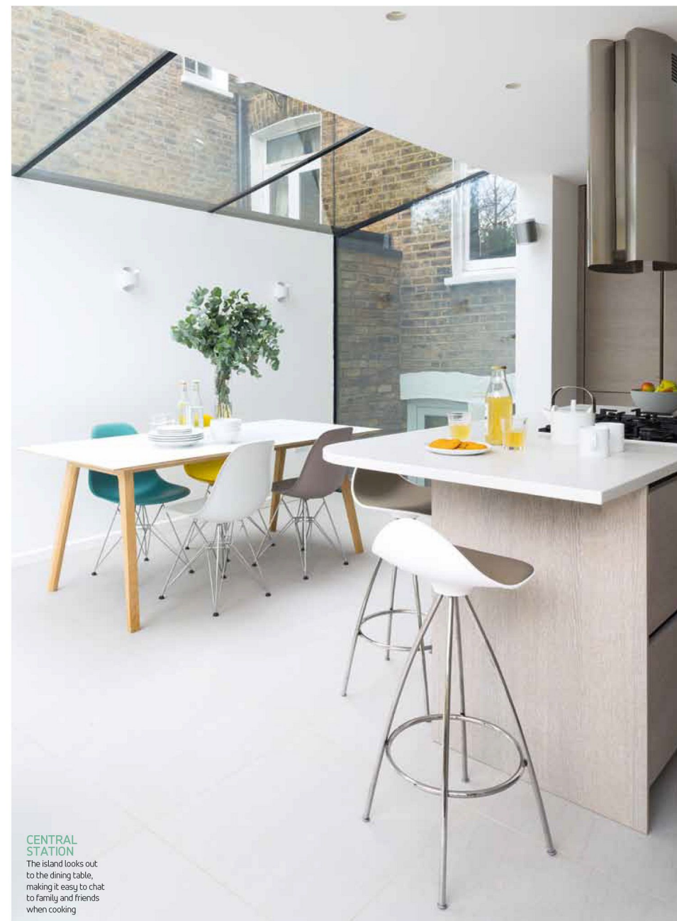
CENTRAL STATION The island looks out to the dining table, making it easy to chat to family and friends when cooking